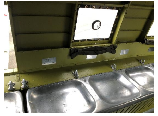
Paratrooper seats were not designed for comfort.

Rides were available for those wanting to experience history by flying in the C-47. I took advantage of this opportunity on April 13. Climbing into the aircraft, I was struck by its